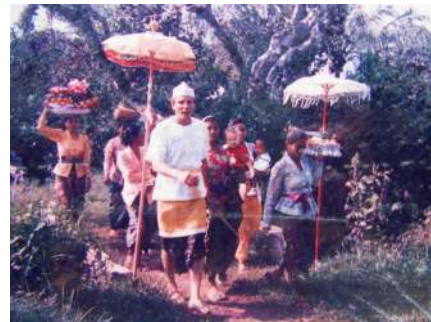
Early Days at Sarinbuana